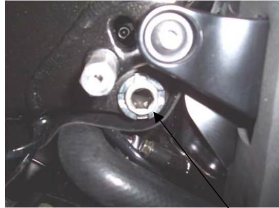
R.H.S bolt to be removed