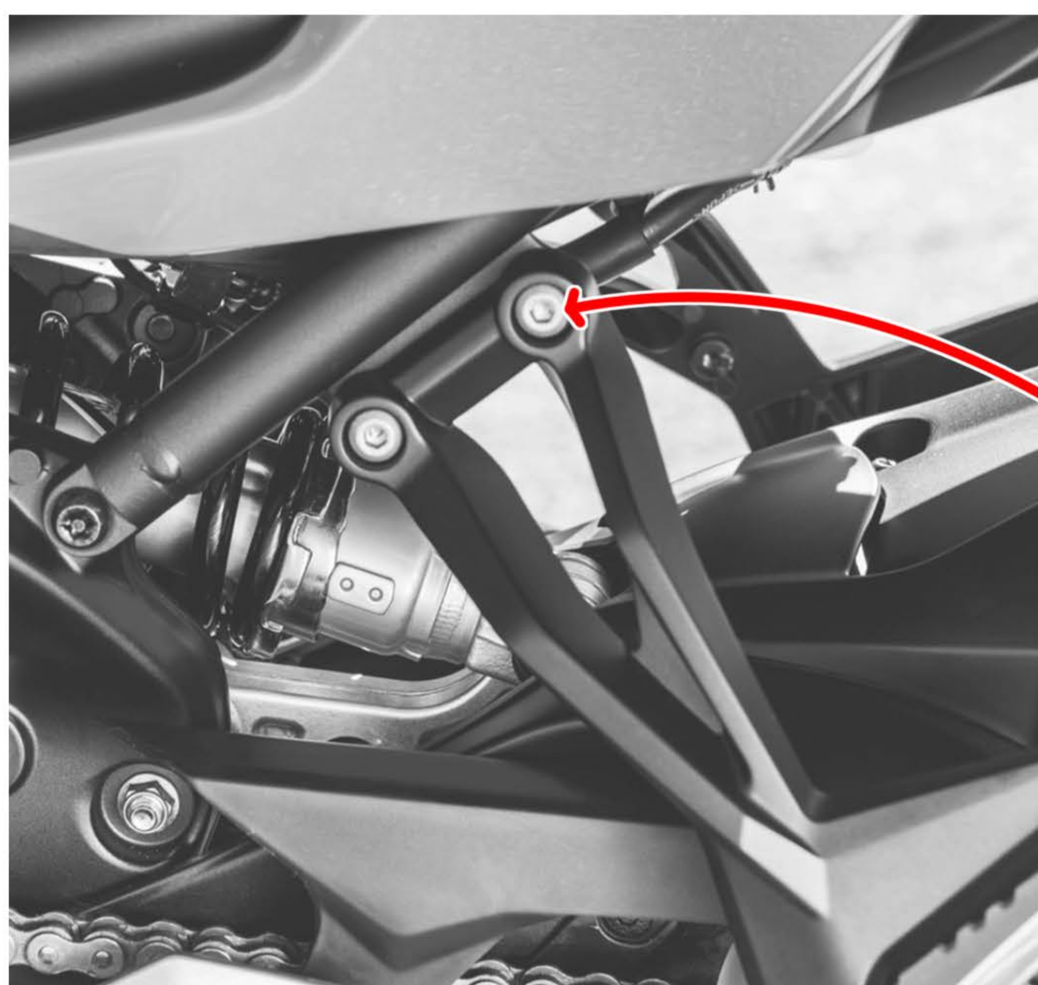
Rear footpeg mounting bolts