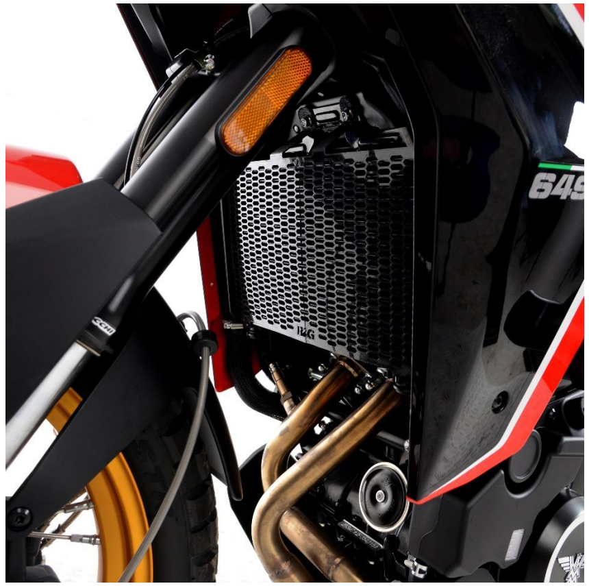
THIS KIT CONTAINS THE ITEMS PICTURED AND LABELLED OVER PAGE.

SOME PARTS MAY BE SHOWN FOR CLARITY OF INSTRUCTIONS ONLY.