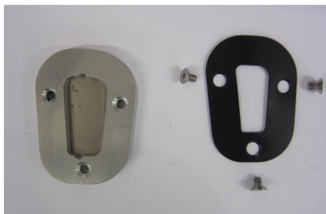
Grundplatte Klemmplatte und Schrauben

Hinweis für Kits mit Plastikunterlegscheiben an den Schrauben – Diese Plastikunterlegscheiben werden nicht für den Einbau benötigt!