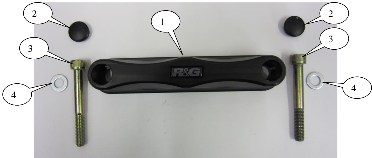
LEFT HAND SIDE

THE PARTS SHOWN MAY BE REPRESENTATIVE ONLY (FOR CLARITY OF INSTRUCTIONS ONLY)