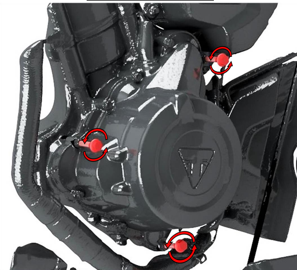
SCHÉMA DE MONTAGE 1